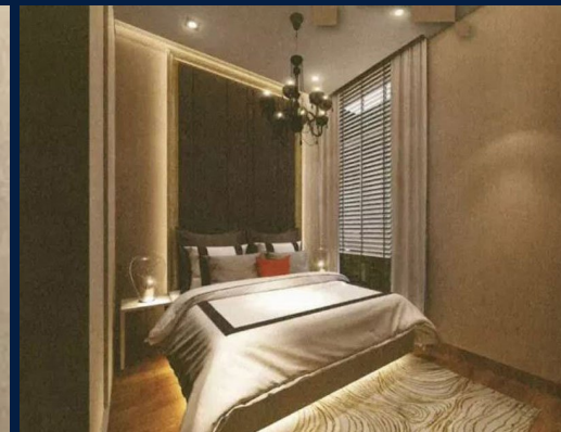
3 - Bedroom