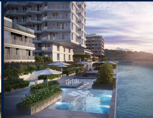
3 - Bedroom Villa