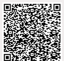
Scan QR Code

https://agents.huttonsgroup.com/R008015F