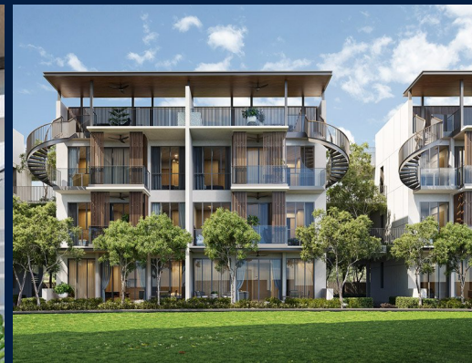
Sereen : 3 - Bedroom