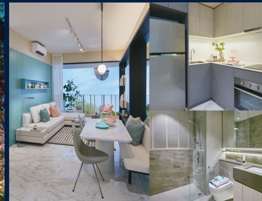
2 - Bedroom + Study