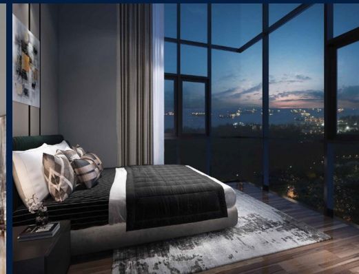
3 - Bedroom