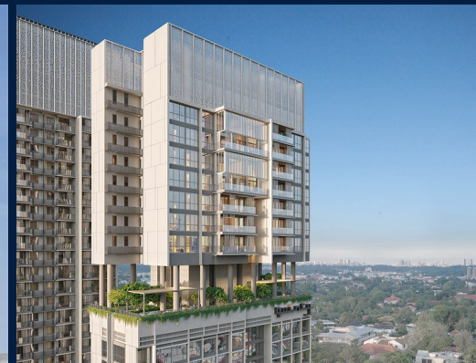
Screen : 2 - Bedroom