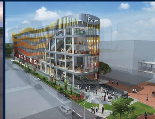
3rd & 4th Storey