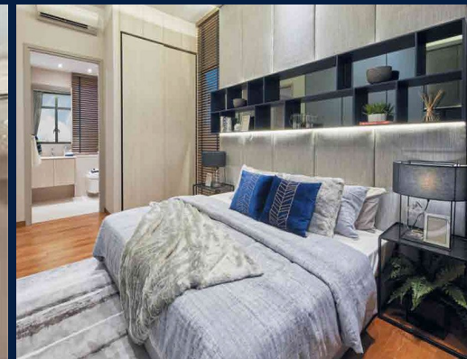
1 - Bedroom